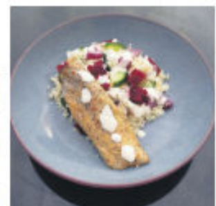
Beetroot and mackerel salad

This recipe contains smoked mackerel, containing healthy omega-3 fats, but would be on the 'eat occasionally' list for salt content. The saltiness of the mayonnaise is reduced by thinning with yoghurt and water.